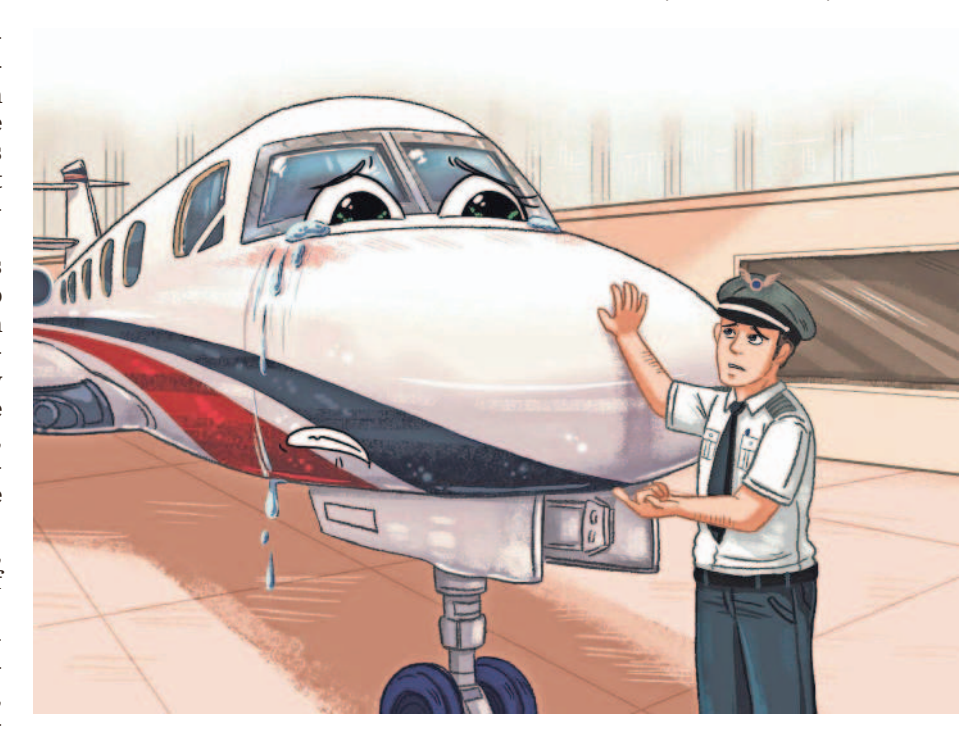
An inside illustration of "Astra The Lonely Airplane" PROVIDED

For more information, to contact the author about an appearance, or re-